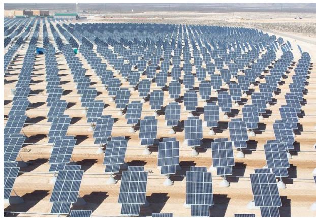
Figure 1: Photovoltaic (PV) solar farm showing typical arrangement of photovoltaic panels.